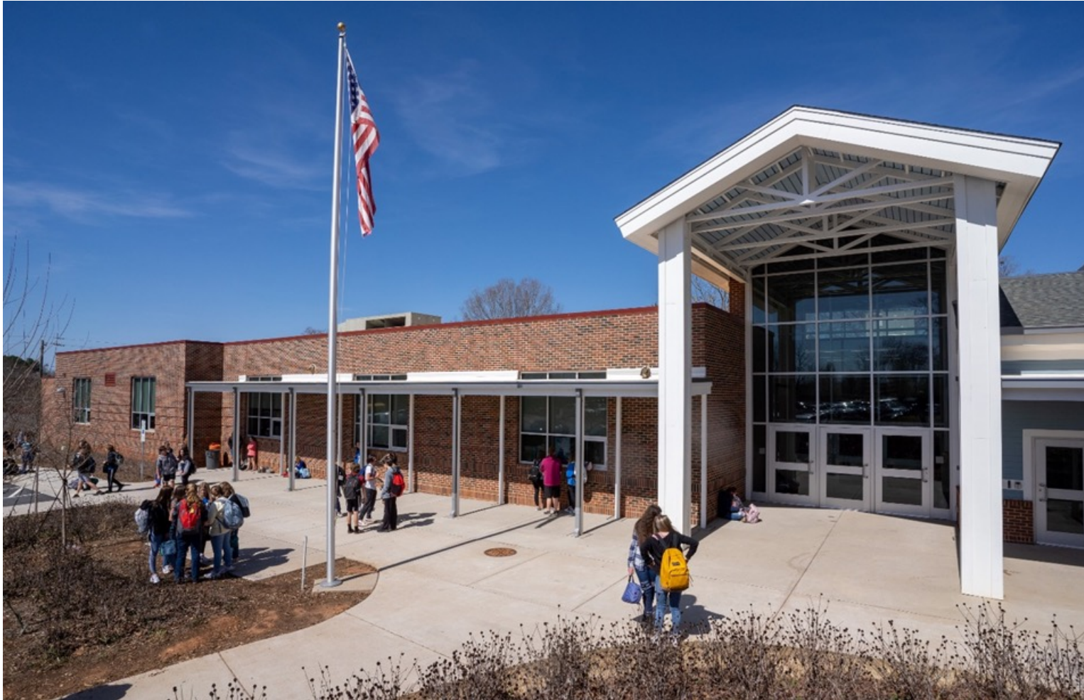
New Granite Falls Middle School Campus facade