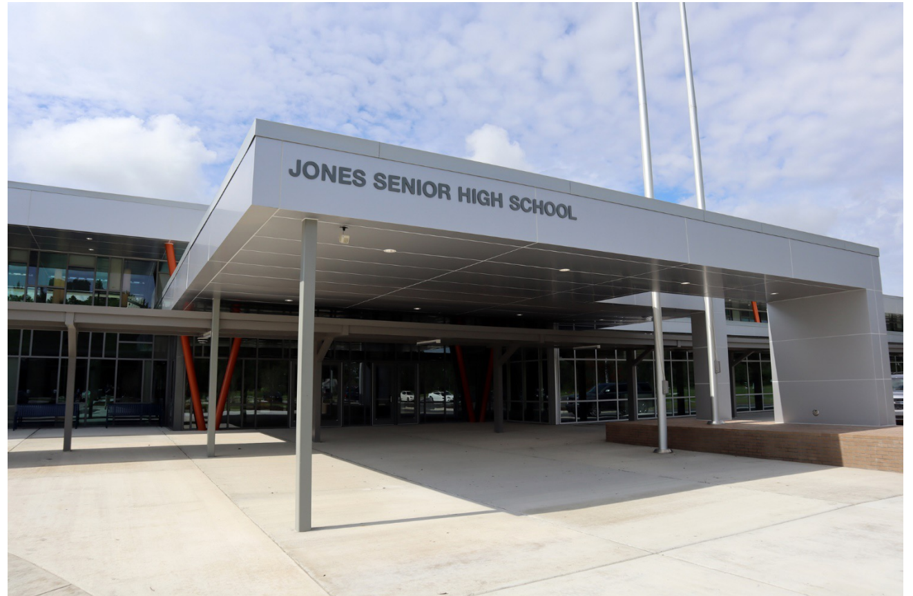
New Jones County School Campus