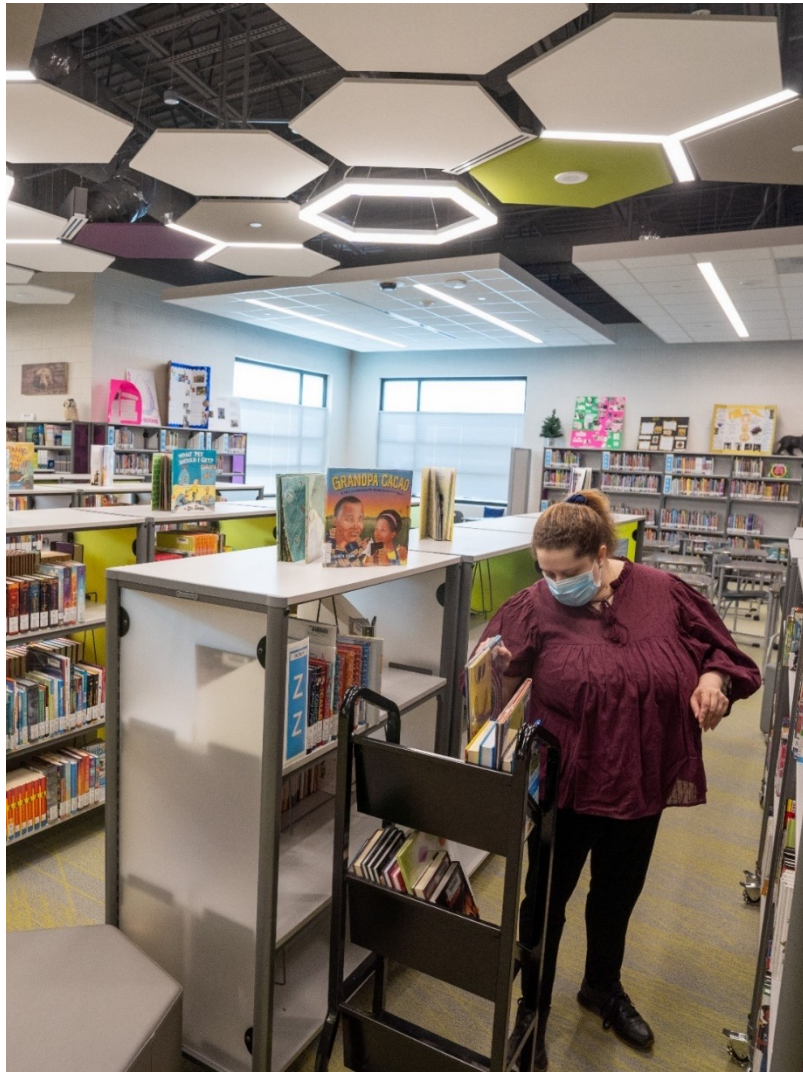
New library at Ahoskie Elementary School