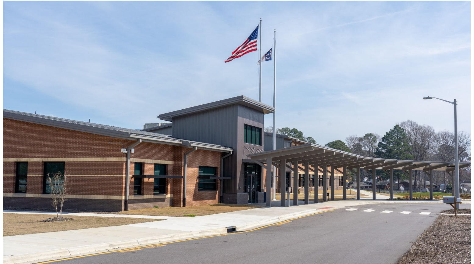
New Ahoskie Elementary School Campus facade