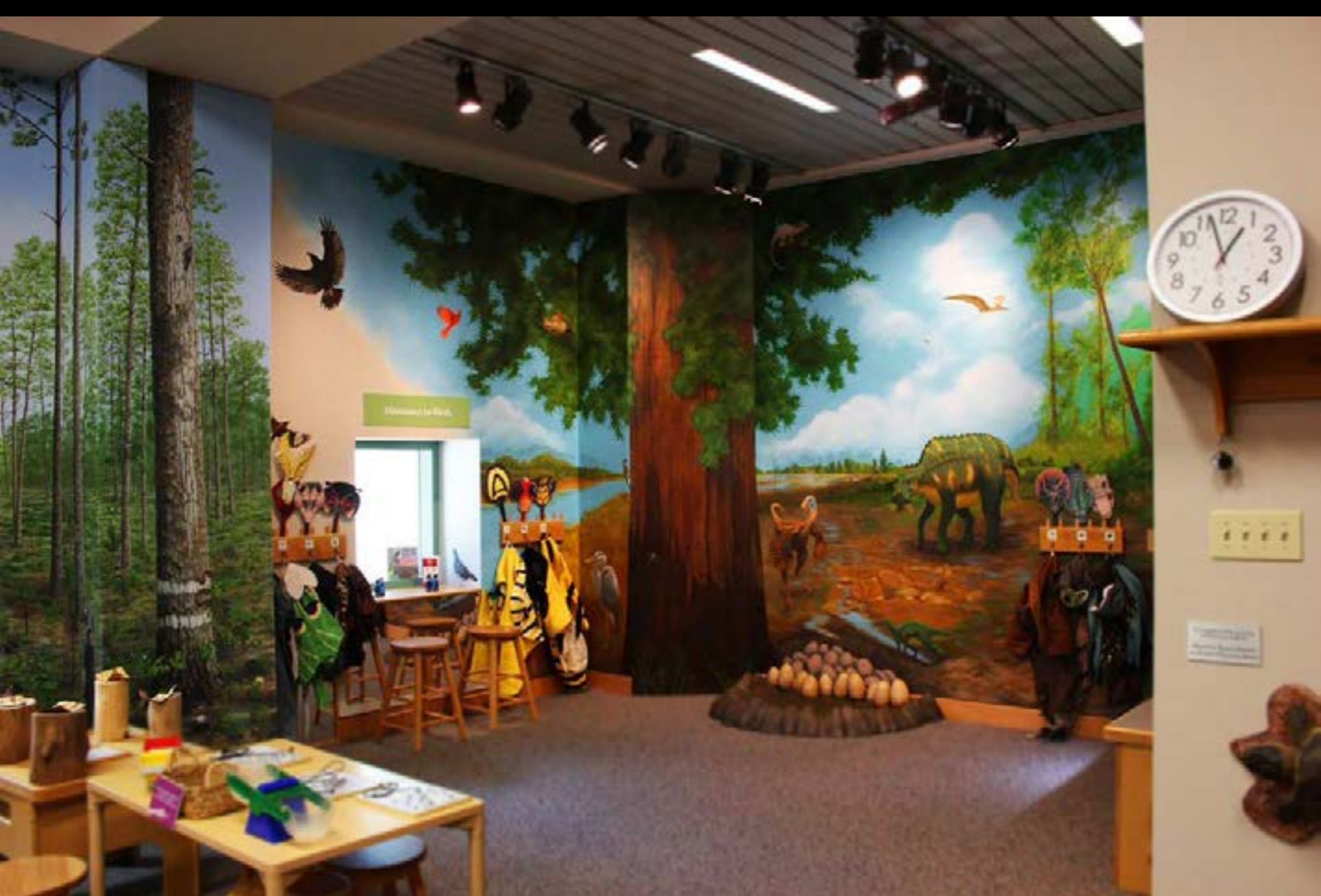
The Discovery Room - NCMNS, Raleigh