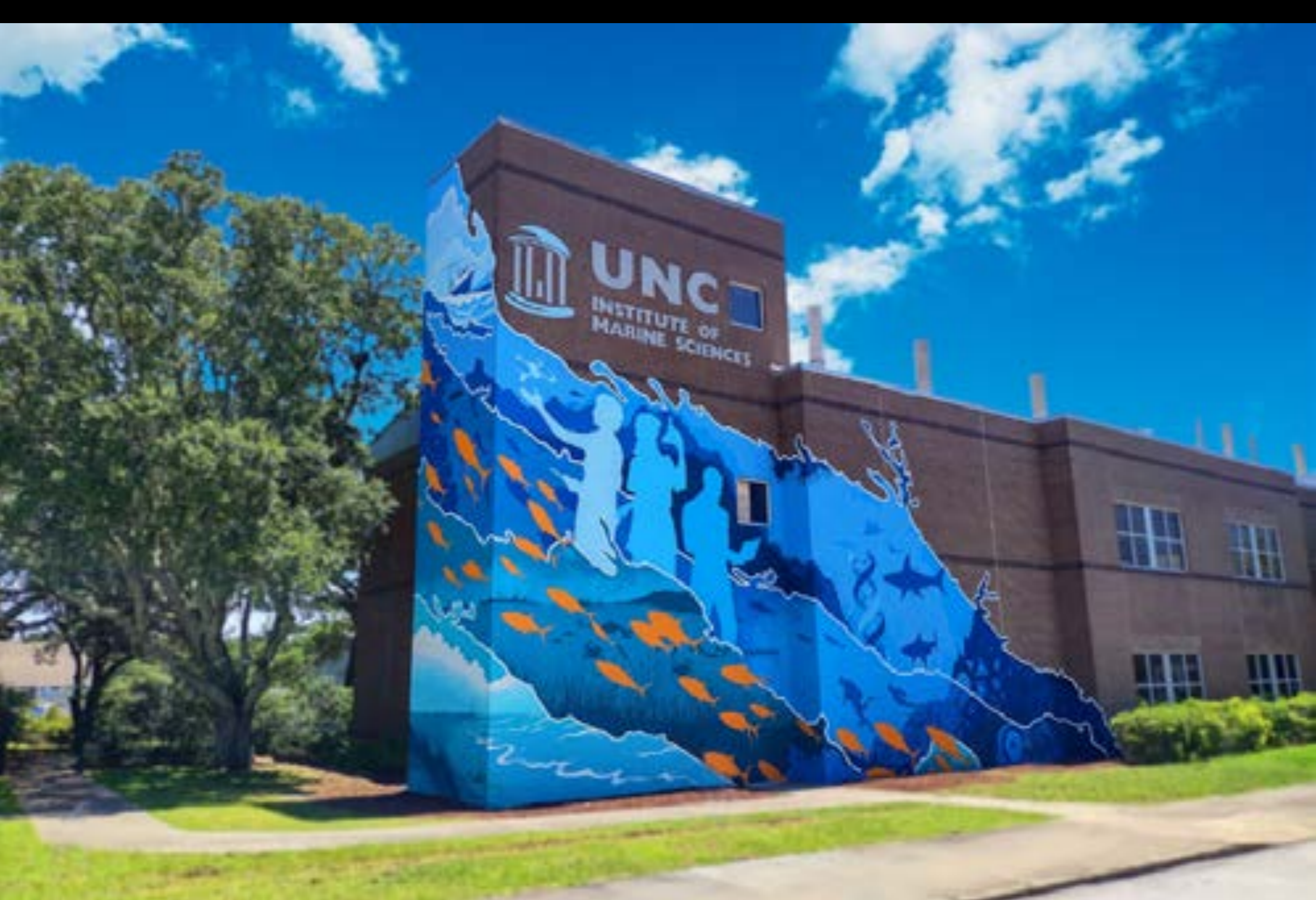
Charting Depths in the Sea of Knowledge - UNC:IMS, Morehead City