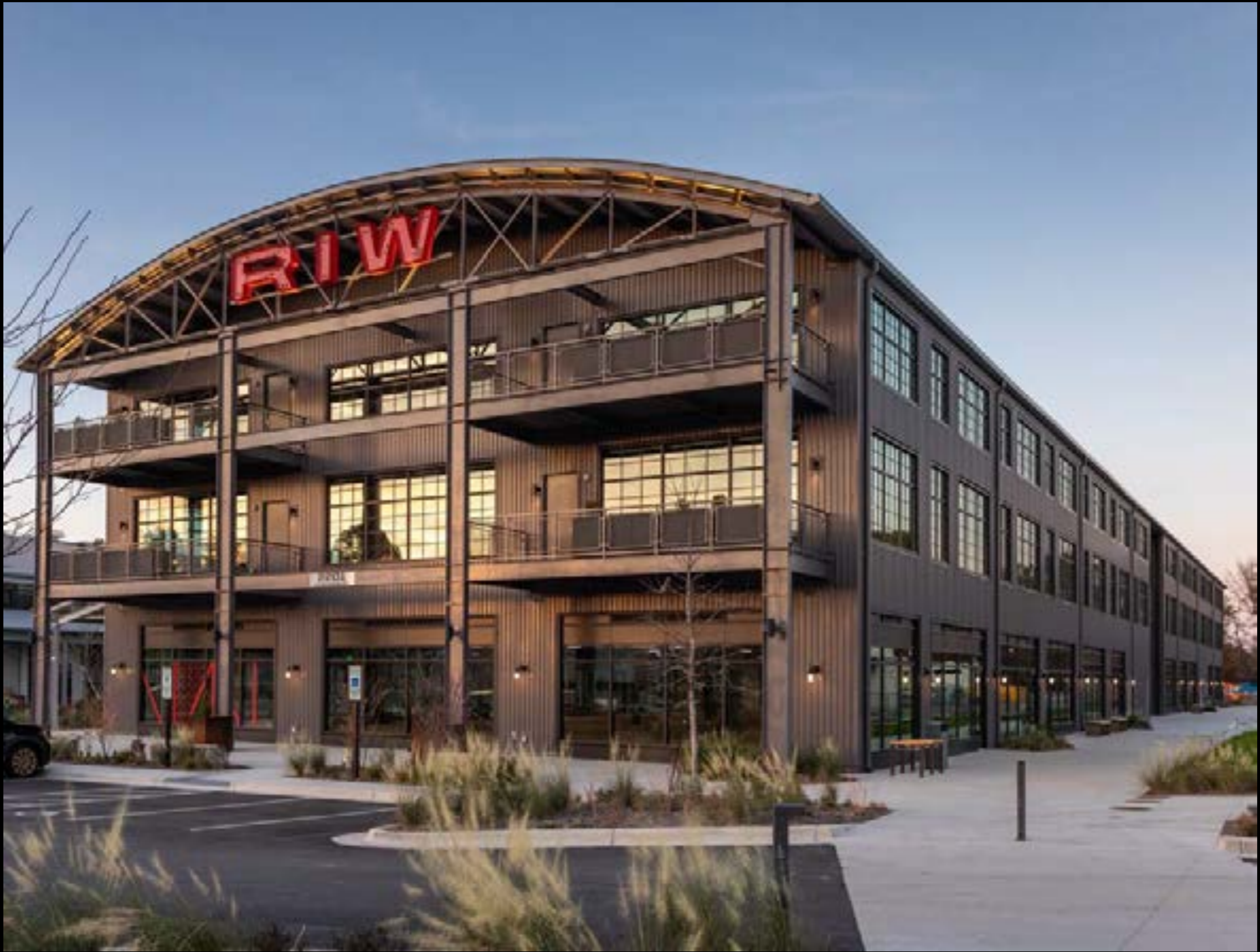
Current Project: Raleigh Iron Works