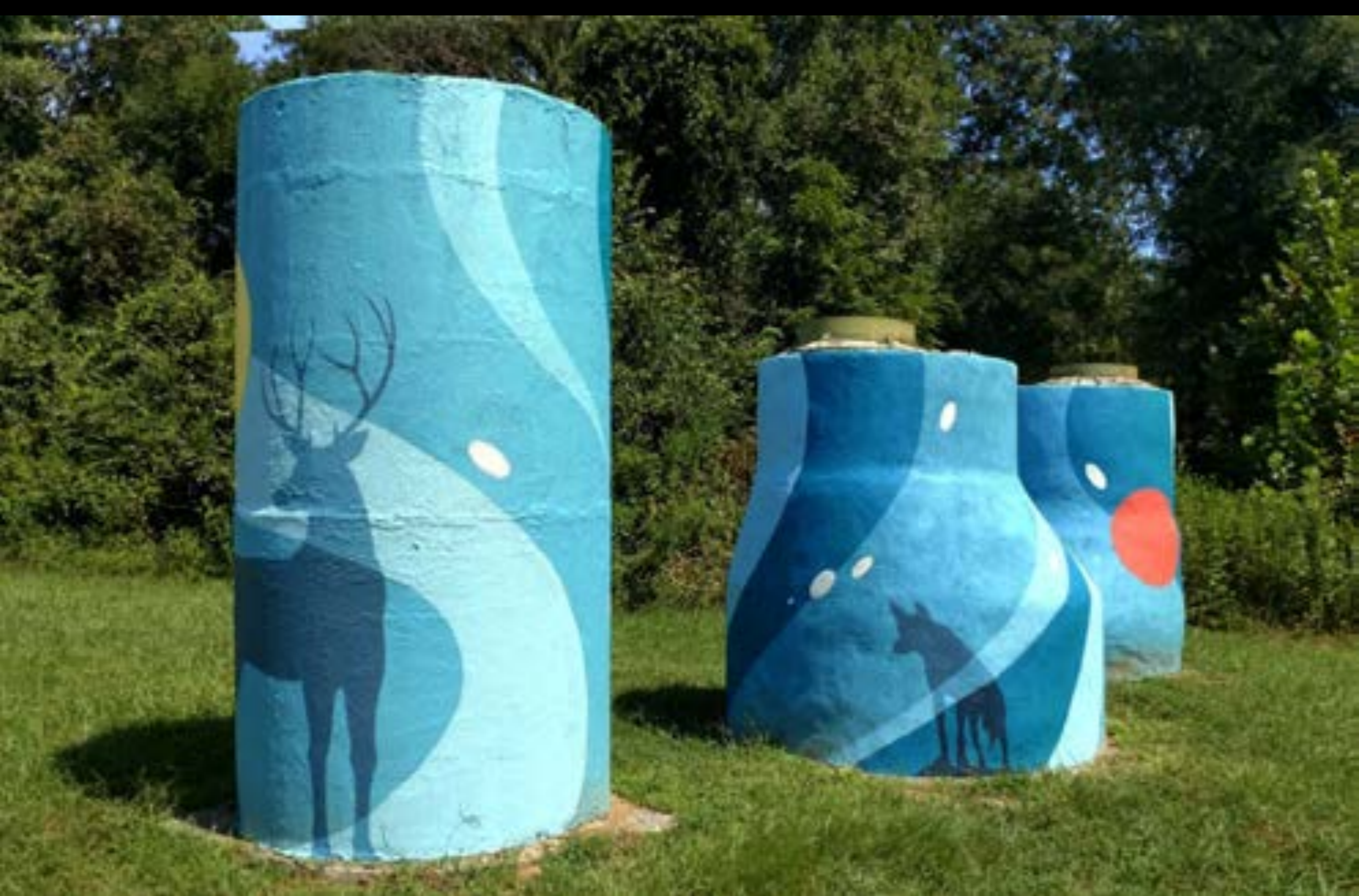
Booker Creek Greenway - Chapel Hill