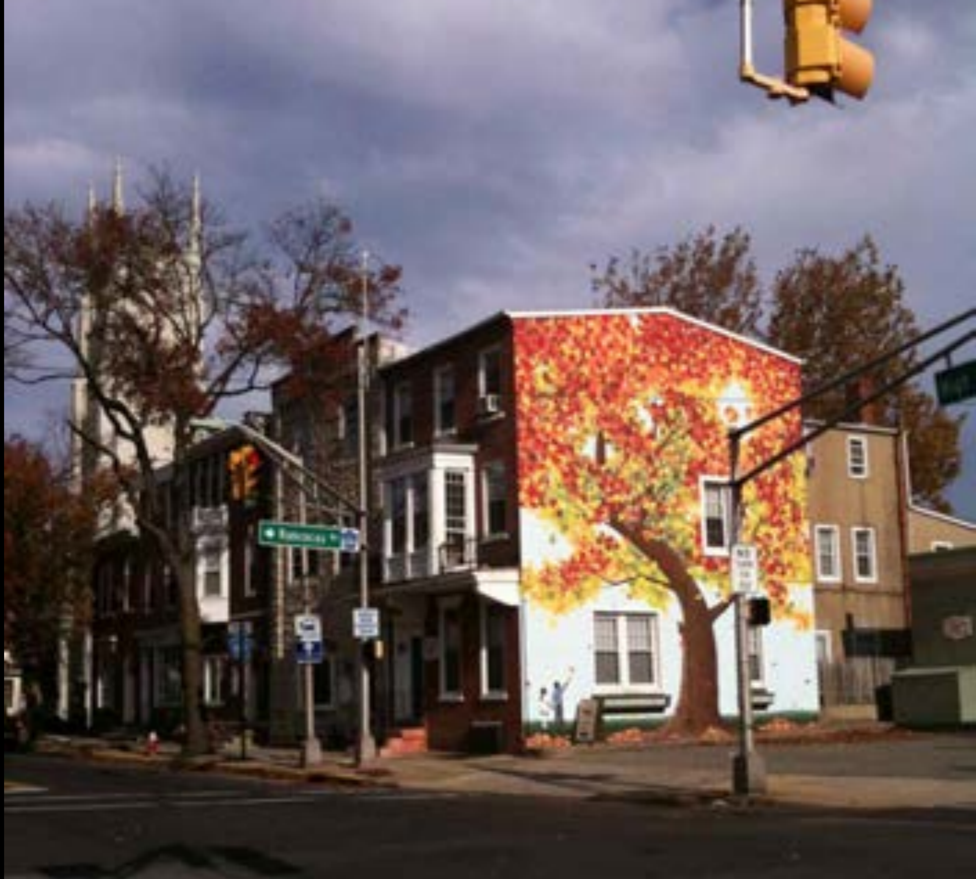
Autumn - Mt. Holly, NJ