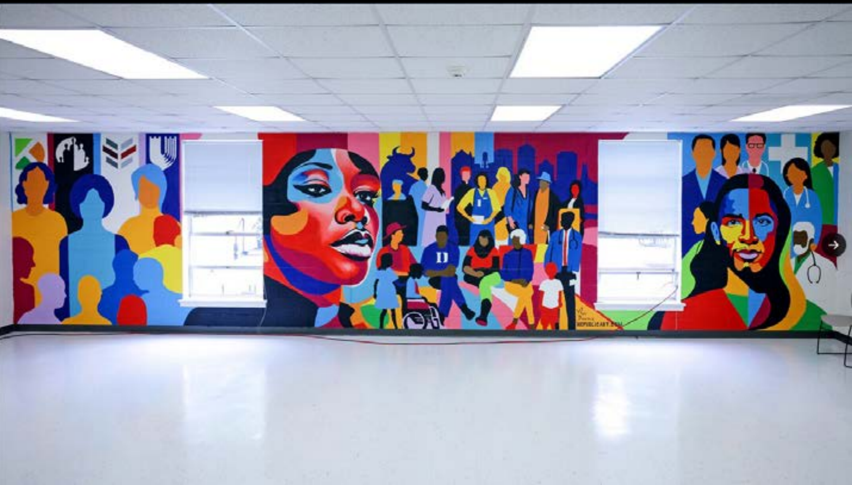
Community Makes Us Whole - Pickett Rd. Clinic: Duke, Durham