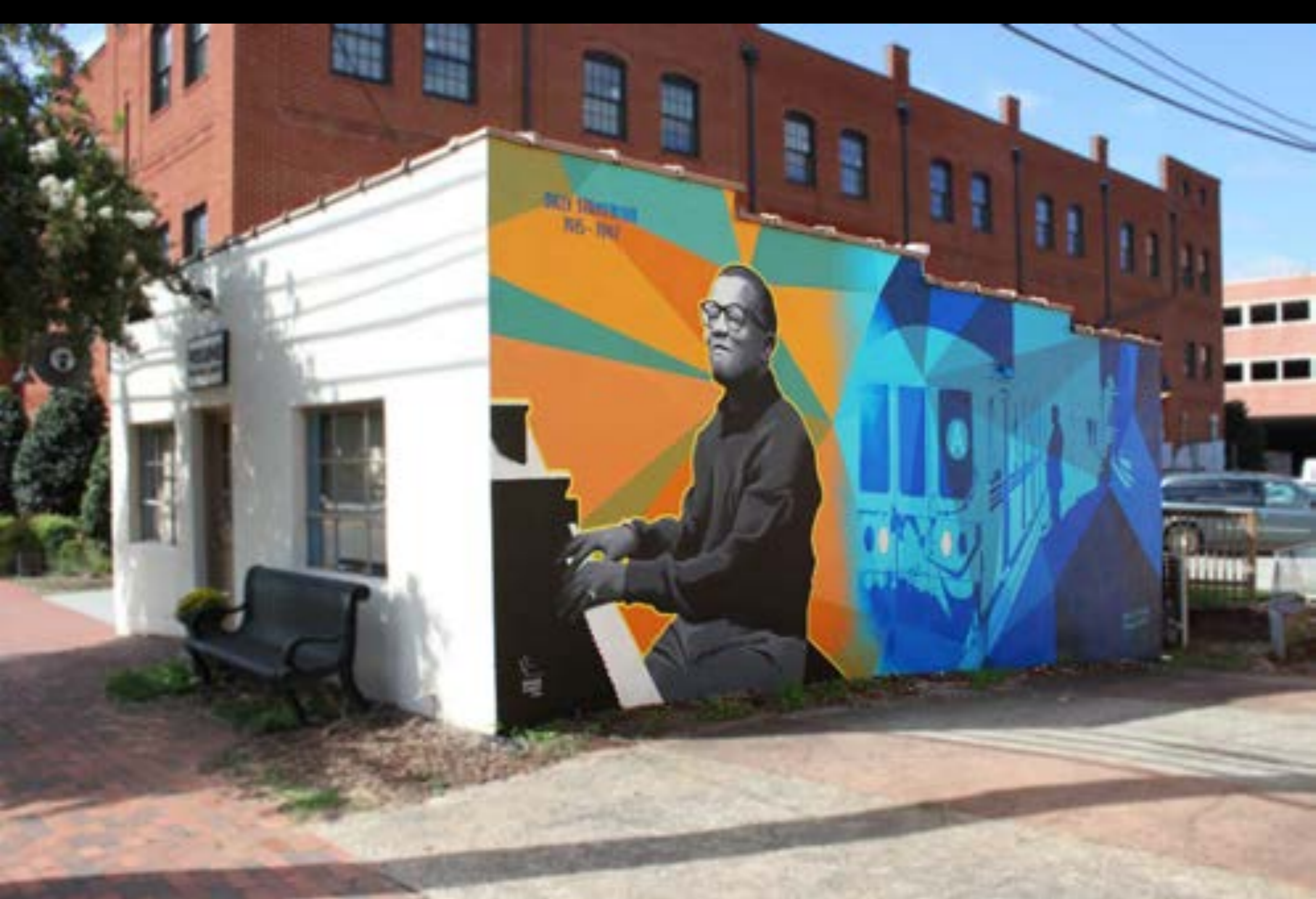
Take the 'A' Train - Hillsborough