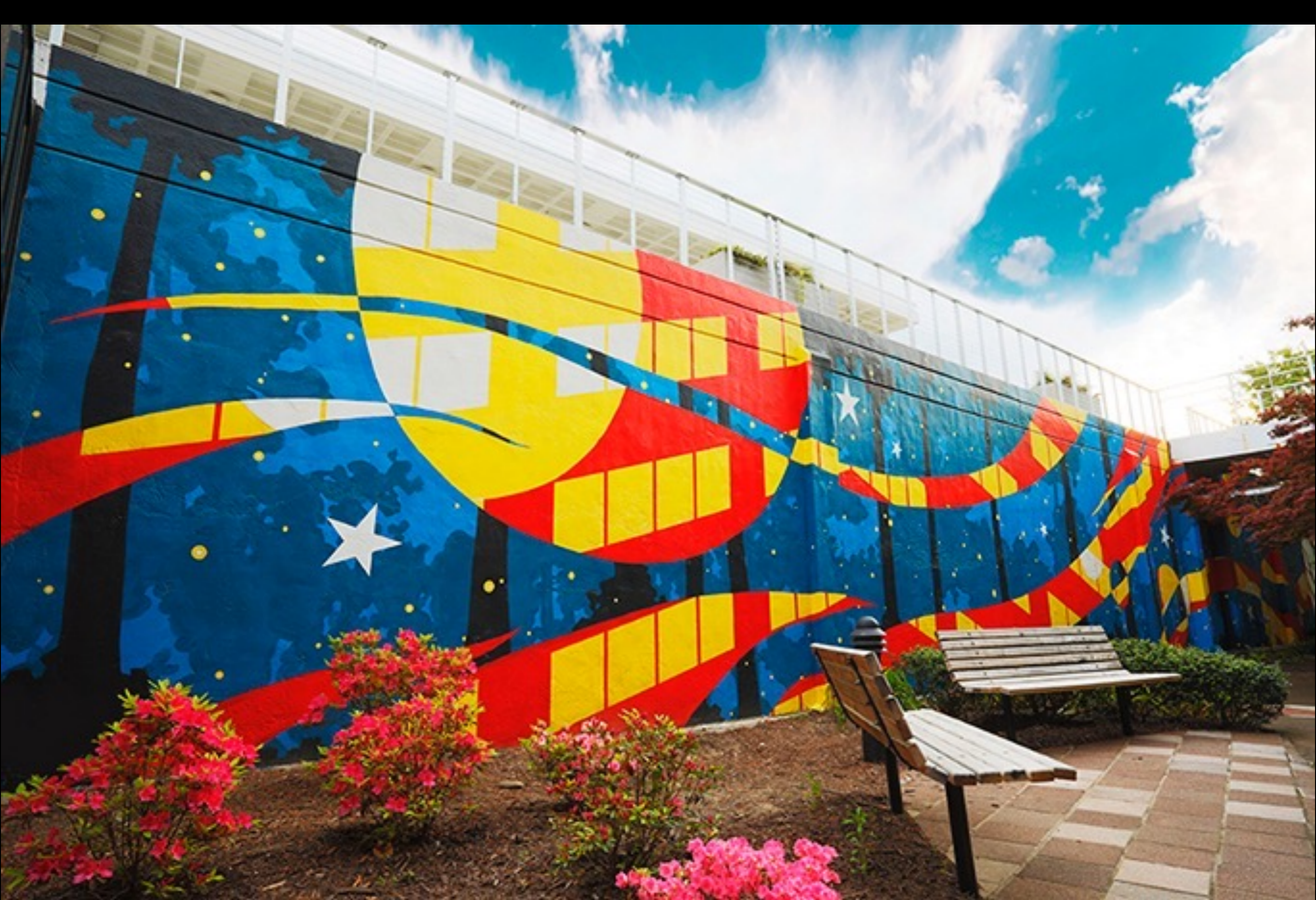
Yesterday's Tomorrow - City Hall, Durham