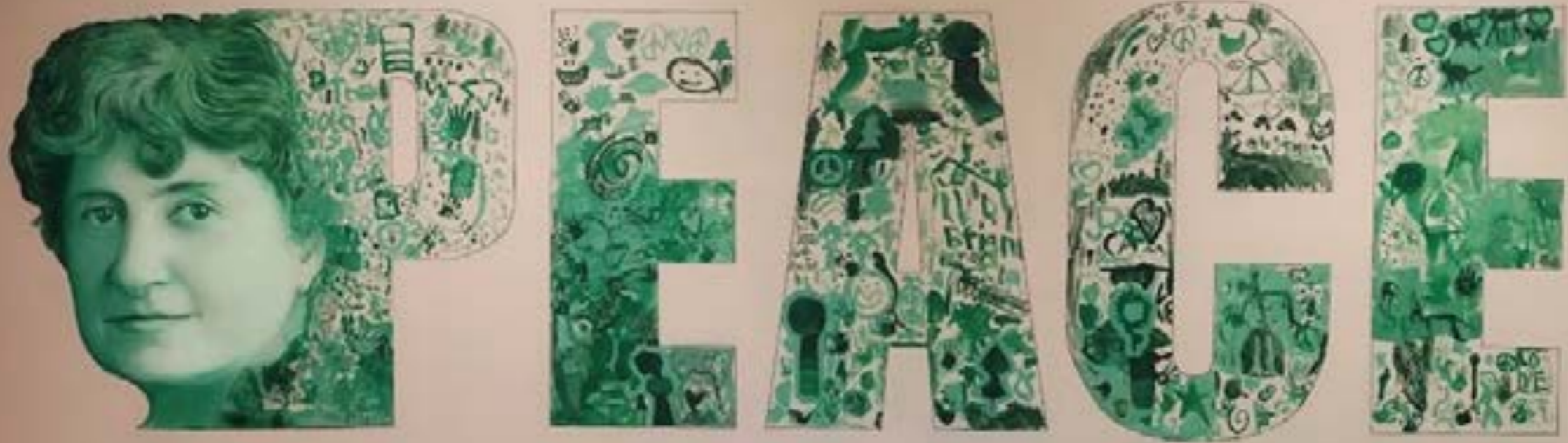
Pinewoods Montessori - Hillsborough