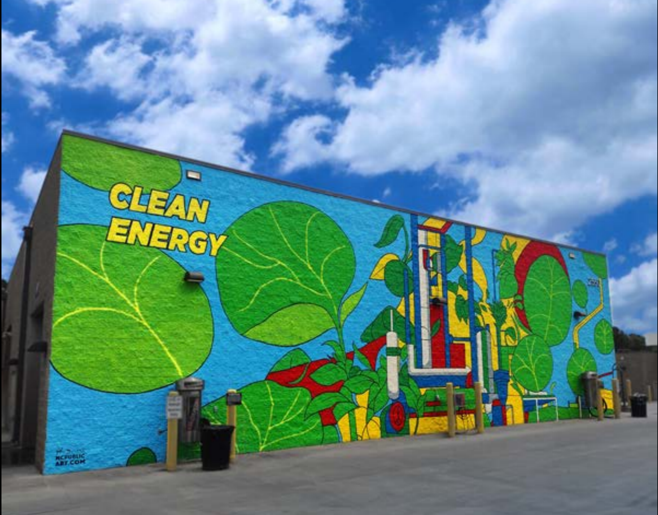
In the Land of Clean Energy - Fleet Services, Raleigh