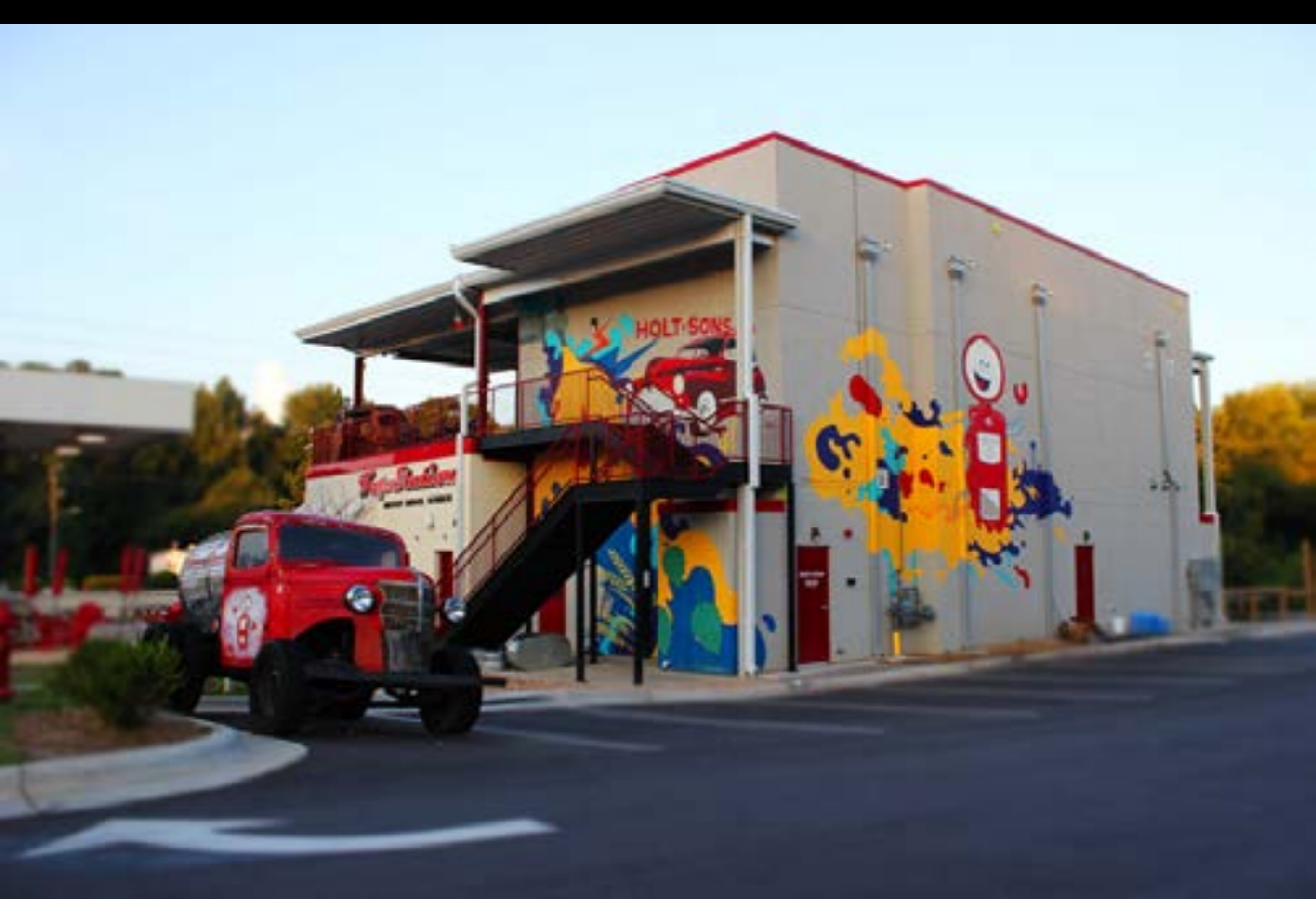
Tapstation - Apex