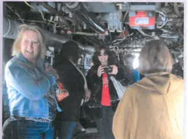
Onboard the Osprey