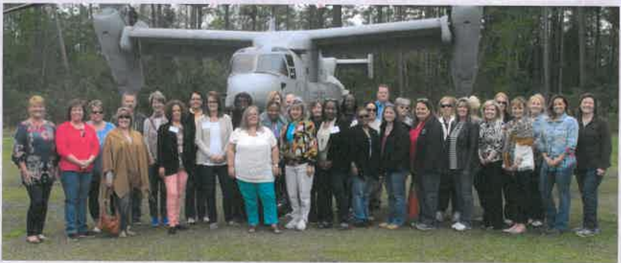
New River Aviation Memorial